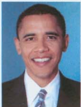
CHRISTOPHER H. SMITH Member of Congress